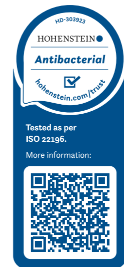
Certificate for PerfectSense

Our products are made without antibacterial additives and are tested according to the main internationally recognised test method (ISO 22196 = JIS Z 2801) for the evaluation of antibacterial activity. In addition, our products are certified by the independent, external Hohenstein Institute.